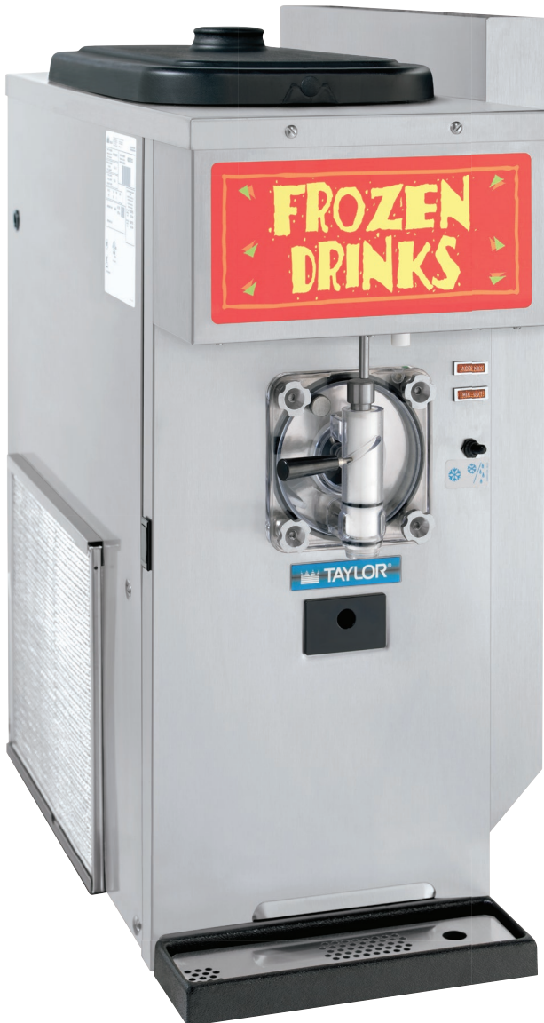
Shown with optional top air discharge chute

Removable, cleanable and reusable air filter keeps the condenser clean for optimal refrigeration system performance.