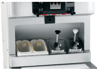
Integrated Syrup Rail Option

2 room temperature with lids & ladles, 2 heated with syrup pumps