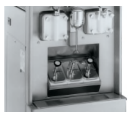
Optional syrup rail and panel spinner

Front casters have a locking feature for operators to lock to maintain equipment in place. The locking casters can be released to move the equipment for cleaning.