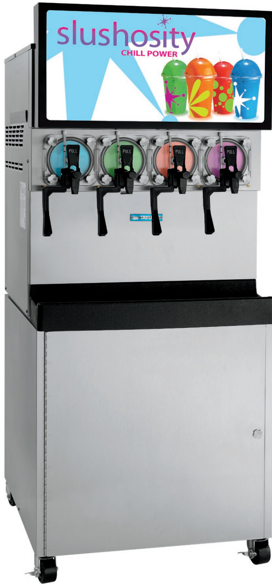
Shown with Slushosity ® Merchandising Materials Consult Taylor distributor for merchandising options.