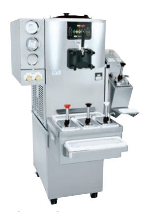
Optional Cart with rear door for front mount syrup rail