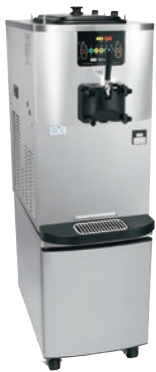
Optional cart with front opening door