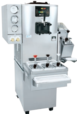
Optional cart with rear door for front mount syrup rail.