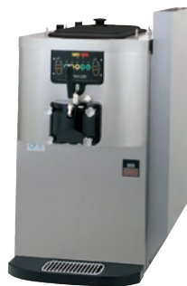
Optional top air discharge chute