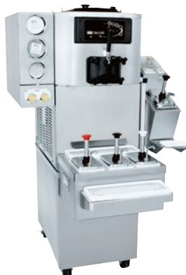
Optional Cart with rear door for front mount syrup rail