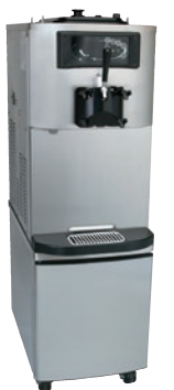
Optional Cart with front opening door