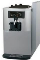
Optional Top Air Discharge Chute